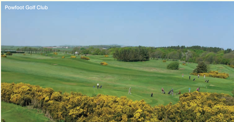
Powfoot Golf Club

To book your Wedding please call 01461 700254