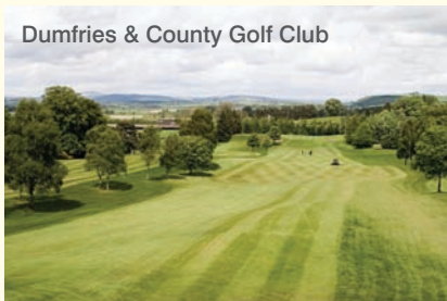
Dumfries & County Golf Club

During your stay we can arrange for you to play at a variety of local courses. These include Powfoot, Moffat, Colvend, Thornhill, Lockerbie, Lochmaben, Southernness, Dumfries & Galloway, Dumfries & County and Silloth-on-Solway.