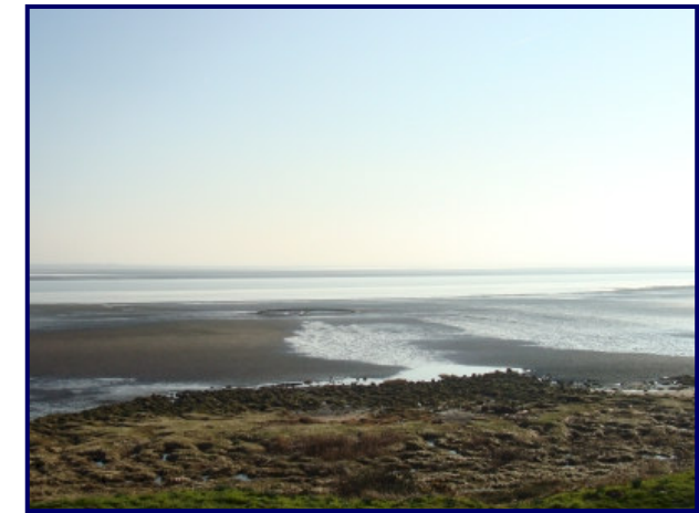
View from the Hotel of the Solway Firth towards Silloth and the Lakeland Hills